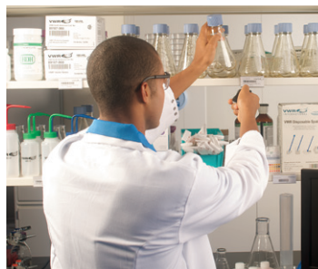
FIGURE 2: The inventory in each of the eight departments was assessed and optimized based on the specific needs at each point of use. Excess inventory (overstock) was then redistributed to other departments appropriately.

Do you need help streamlining scientific workflows?