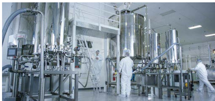
Device designers should be sure to consider high-purity, medical-grade silicone lubricant products supported by Master Files, which include biological tests conducted on each product, with U.S. FDA and international authorities.

After nearly four decades of serving the most demanding industries, we have honed our silicone manufacturing processes and proprietary equipment to support unique products, product form factors and packaging. From start to finish, we offer direct access to a team of chemists, engineers, regulatory experts and technical specialists. This collaboration allows us to meet tight design and production parameters to give medical device manufacturers a competitive advantage when working with medical silicone lubricants for demanding applications