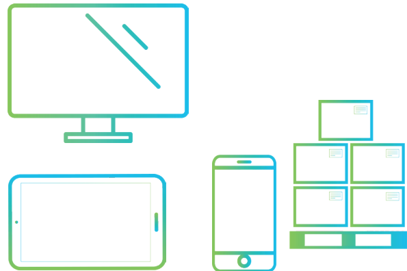
Multiple user interfaces

Benefit: The right fit for each customer's needs.